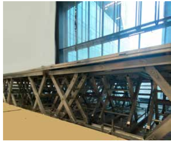
SHOWLIFT DURING INSTALLATION AT MASSEY HALL