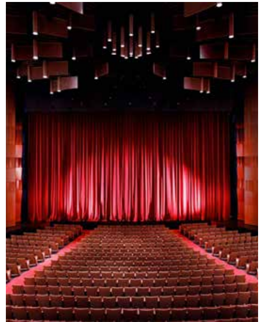
Project: National Art Center in Ottawa

Our sewing and installation services work hand in hand to ensure that your curtains meet your exact specifications. Our experts are qualified to take precise measurements so that your curtains are installed perfectly. We pay the same attention to detail and work with the same professionalism whether it is a large theater or a smaller event.